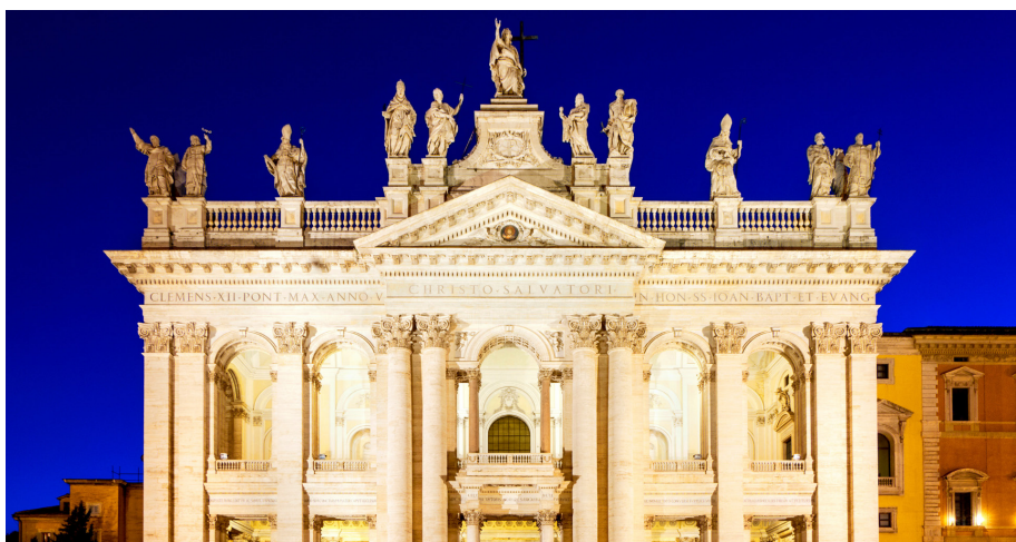
Basilica of St. John Lateran