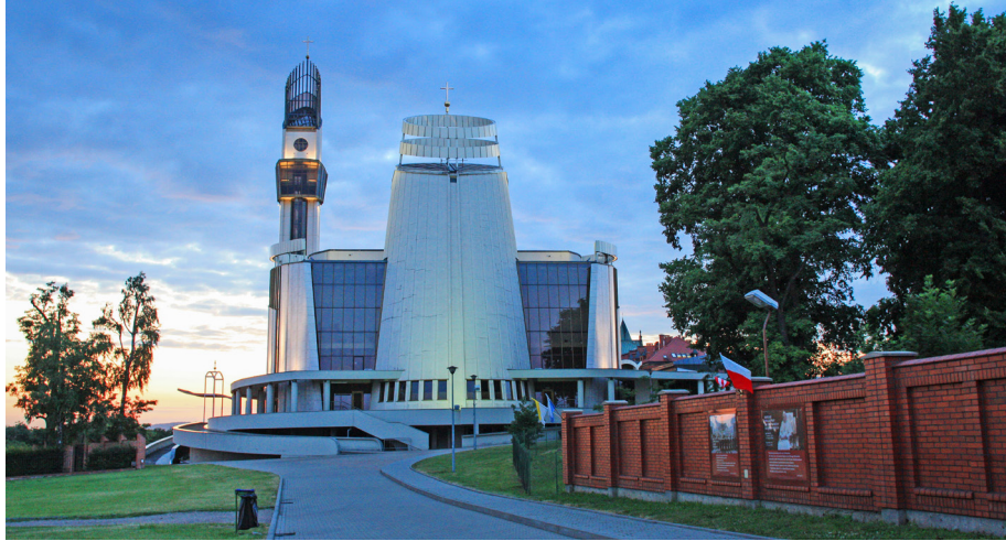
Divine Mercy Shrine, Lagiewniki